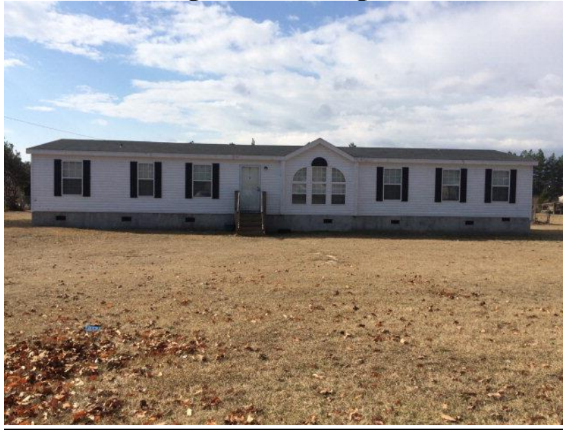
240 PERRY ST