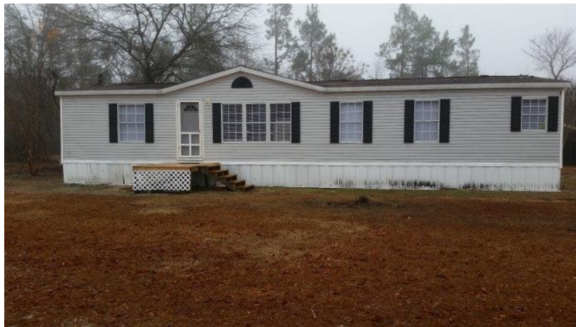
111 TEAKWOOD RD