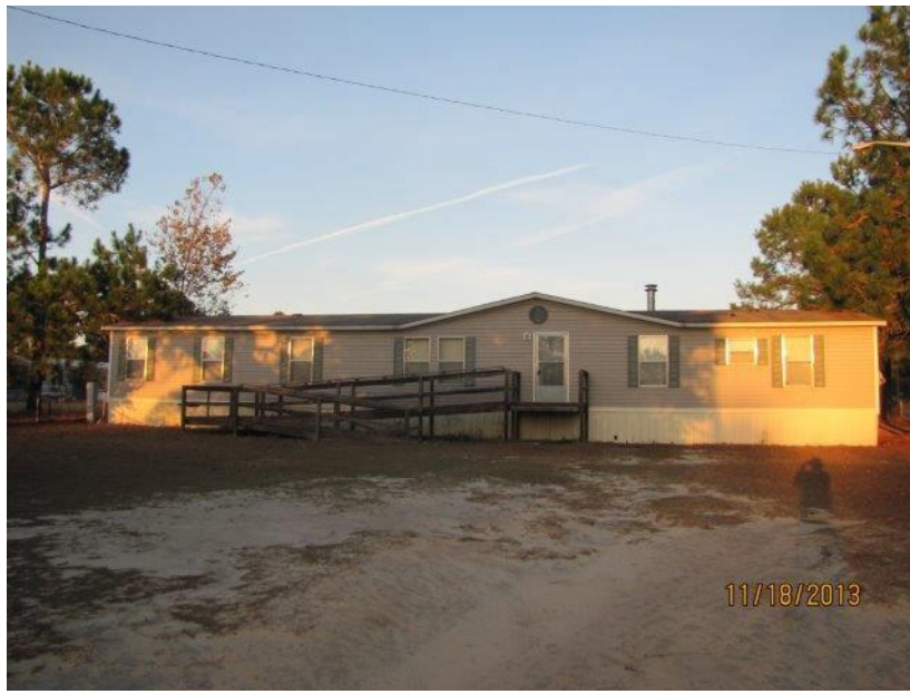
117 PERRY ST