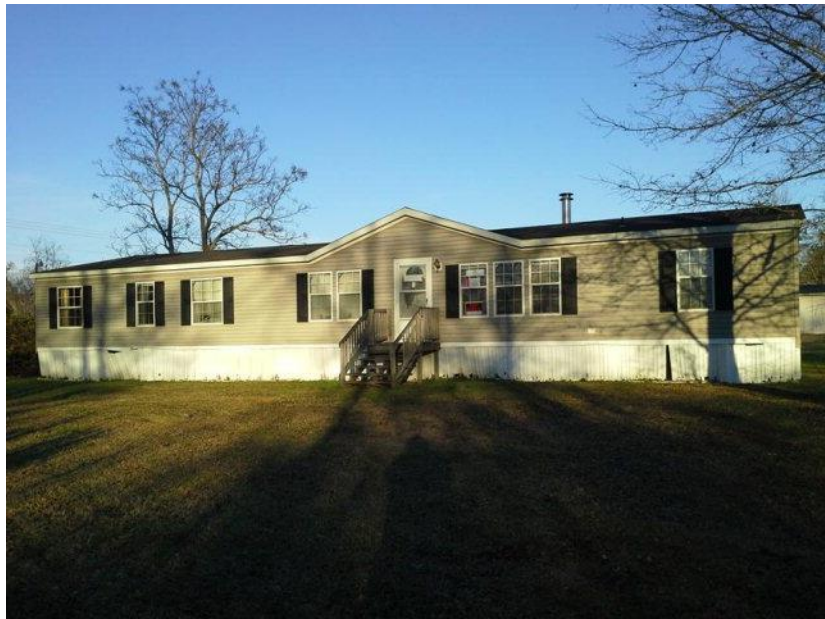
2013 FELDERVILLE RD