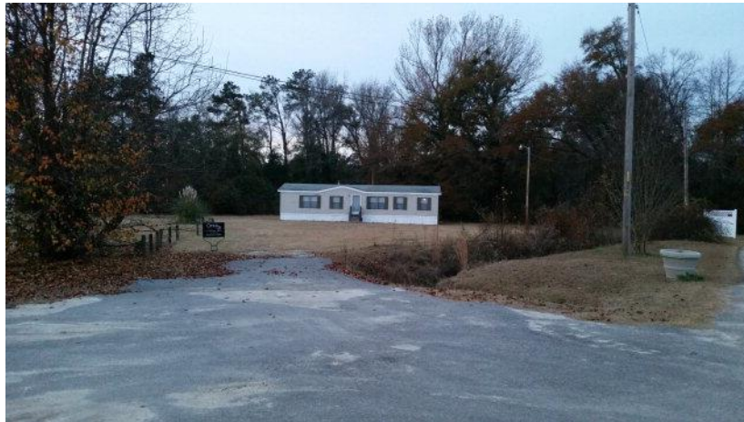
150 MELVIN RD